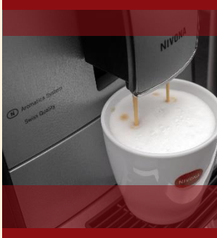
EASY CLEANING REMOVABLE BREWING UNIT